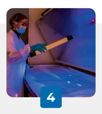
Read results with a 365nm UV light with visible light filter: only semen stains will glow in a blue color